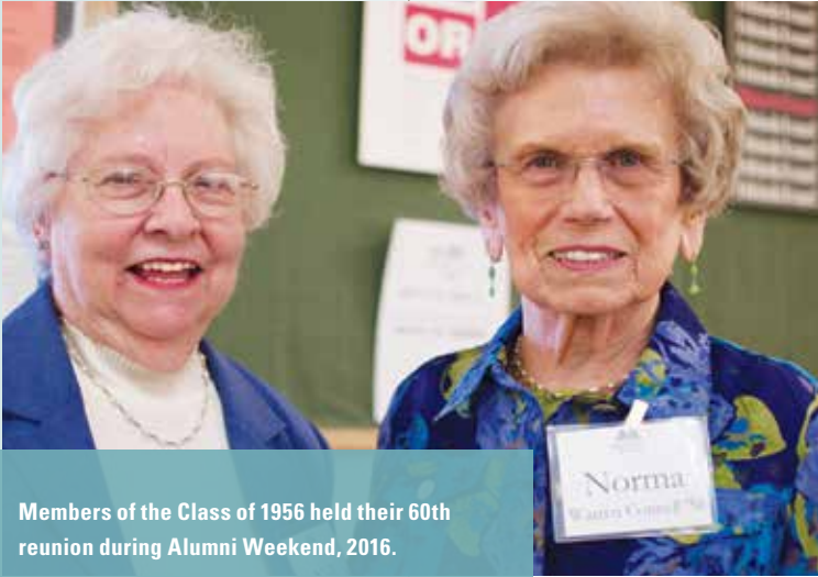
Members of the Class of 1956 held their 60th reunion during Alumni Weekend, 2016.