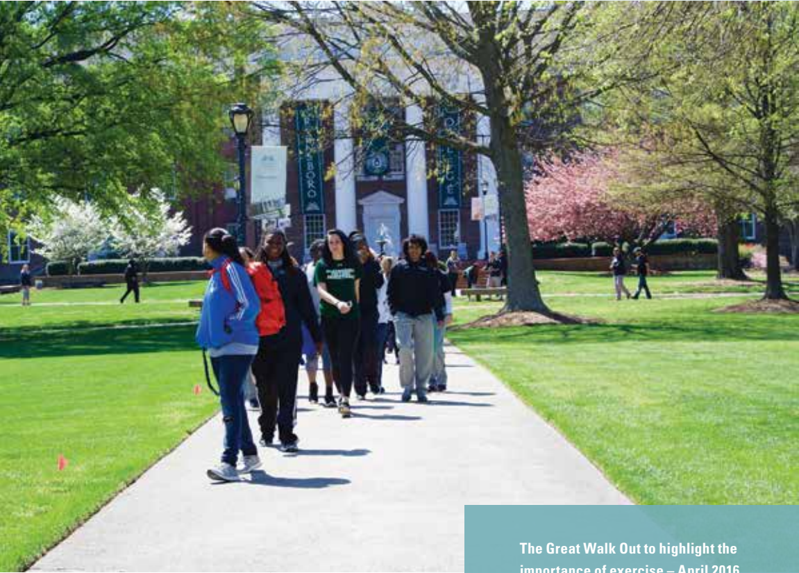
The Great Walk Out to highlight the importance of exercise – April 2016.