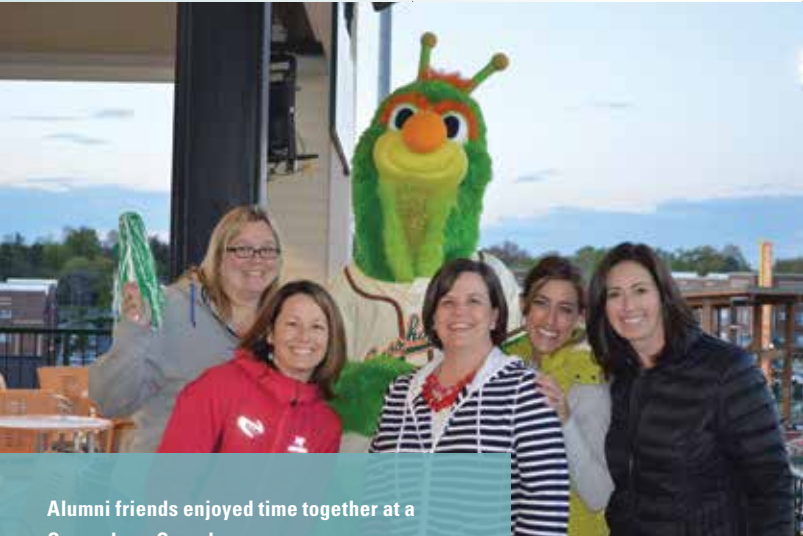
Alumni friends enjoyed time together at a Greensboro Grasshoppers game.