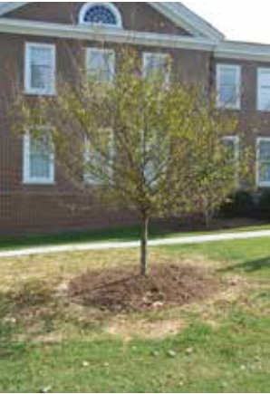
An American hornbeam tree was planted in front of Proctor Hall West in Bowman’s memory and dedicated on Oct. 27.