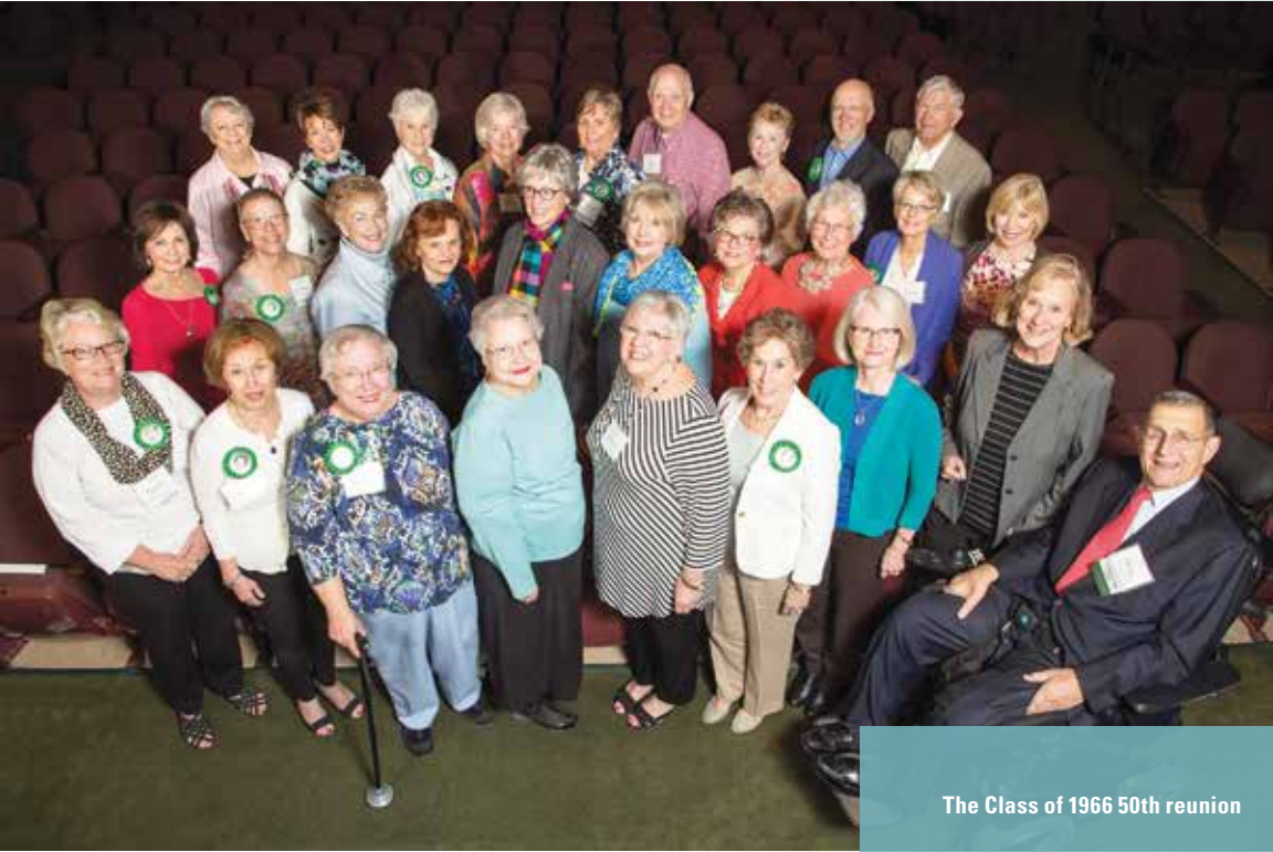
The Class of 1966 50th reunion