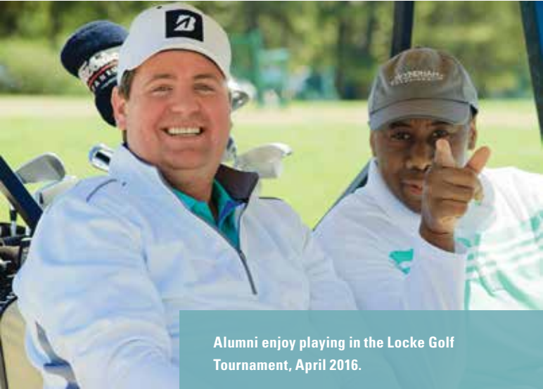
Alumni enjoy playing in the Locke Golf Tournament, April 2016.