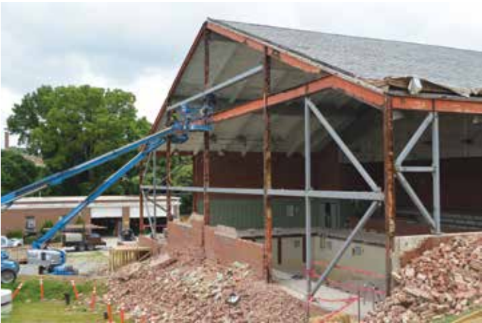
Hanes Gymnasium Renovations

Significant facilities improvements In fall 2015, installation of the artificial-turf Pride Field was completed, and its constant use has brought a new energy to back campus for more than a year. Major structural repairs and completion of a multi-purpose area in Hanes Gymnasium, refurbishing all rooms in Hill Hall residence hall, and exterior patch and paint work all have been completed. With construction equipment now gone, repairs can begin on sidewalks.