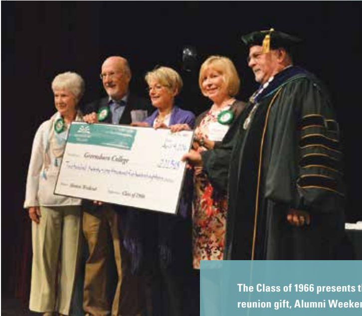
The Class of 1966 presents their 50th reunion gift, Alumni Weekend 2016