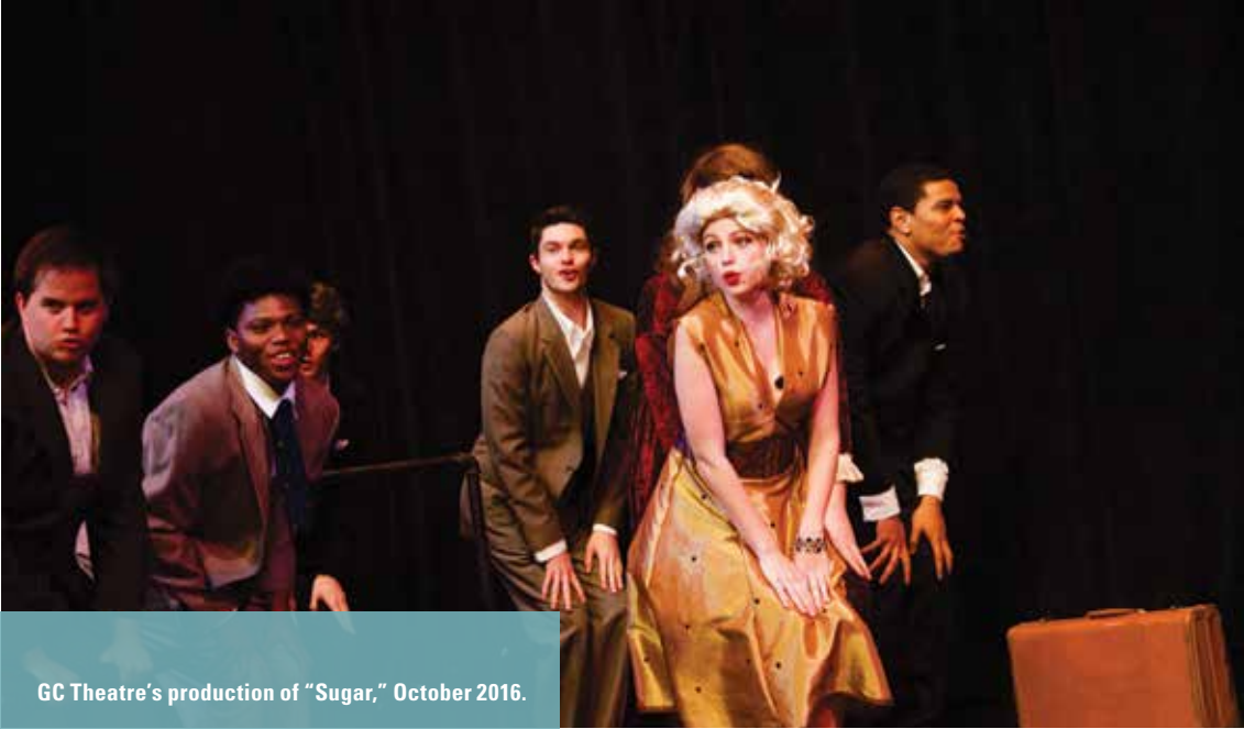
GC Theatre's production of "Sugar," October 2016.

FOWLER DINING ROOM Estate of Ruth Fowler Lindsay '43