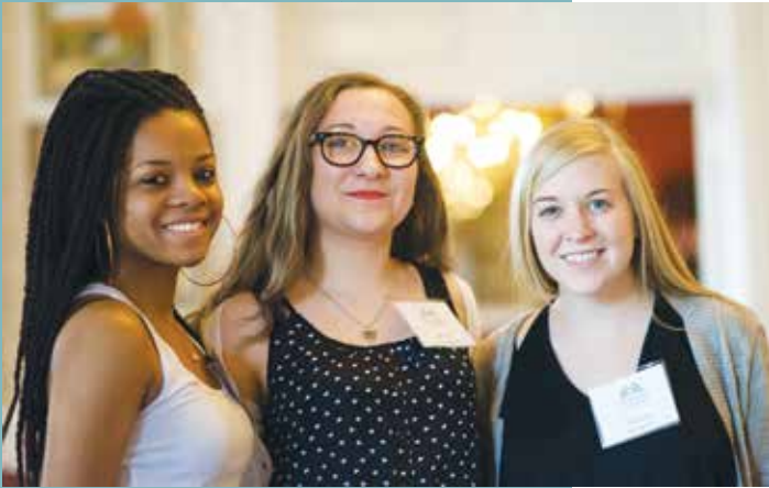
Scholarship recipients who attended the annual Donor Thank-You event in March 2016

For a complete list of our endowment funds, visit our website at https://www.greensboro.edu/givetogc-endowments.php